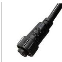
110150 Terminating Resistor WP