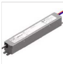
17433 Kit driver 48V