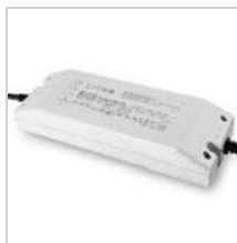
17096 Kit driver 48V WP