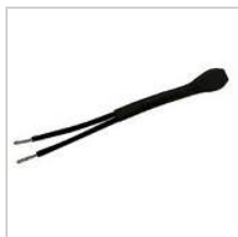
11015 Terminating Resistor