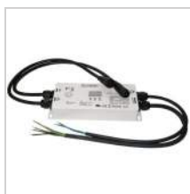
1789730 RGBW DMX enabler/decoder WP 4 channel (0.35A each CH)