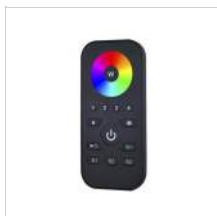
310429 RGBW hand held remote