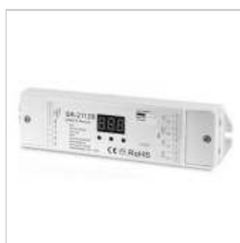
178973 RGBW DMX enabler/decoder 4 channel (0.35A each CH)