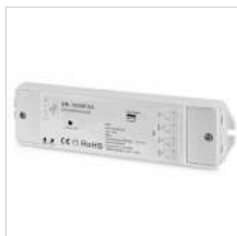
3104173 RGBW RF controller 4 channel (0.35A each CH)